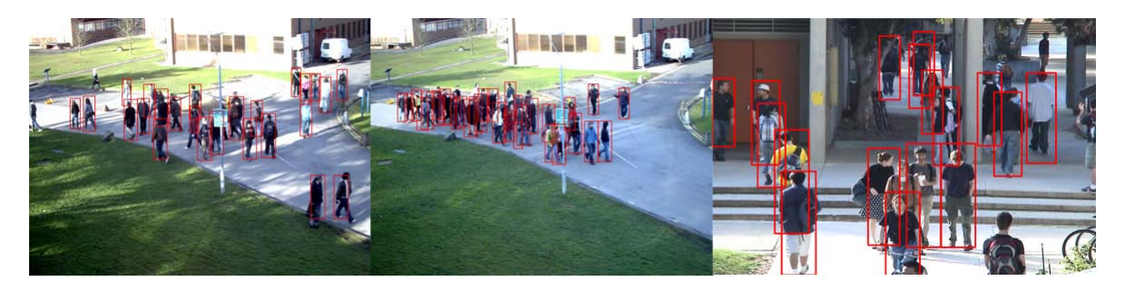
Figure 2. Detection result of proposed method on PETS2009_S2_L2_View001, PETS2009_S2_L3_View001 and UCSD.

proposed method achieve state-of-the-art pedestrian performance in challenging crowded scenes. In our future work, we will incorporate the video information into our method to improve the performance further.