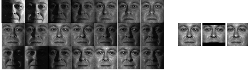
Fig. 3. Left: The 21 images of different illuminations from Person 2 of the PIE database. Right: the full size image, partially occluded image and shifted image.