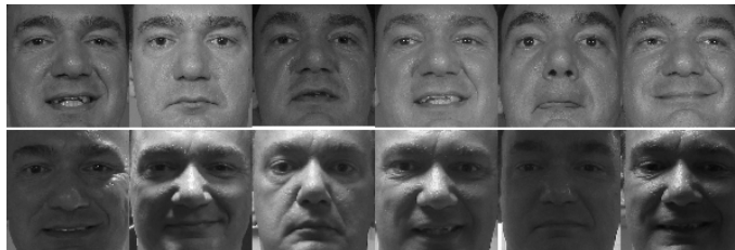
Fig. 4. Some example image for FRGC database. Top row, controlled images. Bottom row, uncontrolled images.